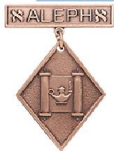
ALEPH: FOR CUB SCOUTS [WOLVES, BEARS, WEBELOS]