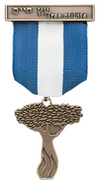
ETZ CHAIM: FOR SCOUTS (Second level award)