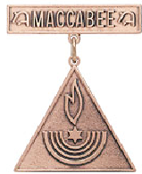
MACCABEE: FOR TIGER CUBS