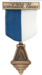
NER TAMID: FOR SCOUTS (First level award)